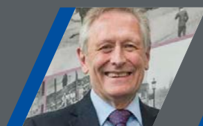
Sir Peter Soulsby City Mayor, Leicester City Council