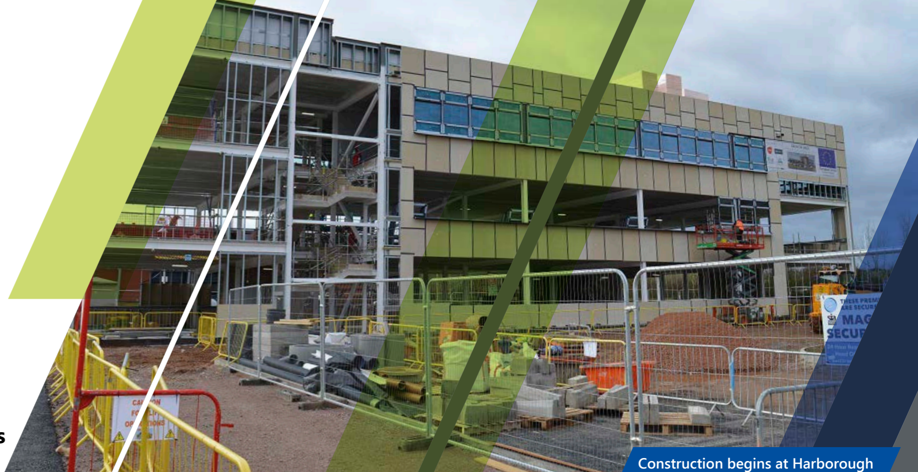
Construction begins at Harborough District Grow on Space

The ESIF Committee has endorsed approximately £10 million ESF, to be matched with opt-in funding from the Department of Work and Pensions (DWP), the Education Skills Funding Agency (ESFA) and the Big Lottery Fund.